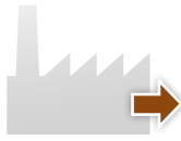
Industrial waste water